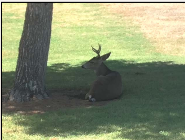
Wildlife was seen by several players on the course